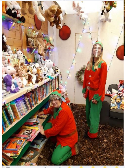
5 star review!

In fact all the elves were amazing but so glad we got Treacle as our guide x